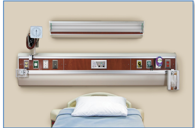
Figure 1. Majestic Series Single Tier Headwall System

The Amico Majestic Series Single Tier Headwall shall be manufactured by Amico Corporation, in accordance with job specific shop drawings and documents. The complete Headwall assembly shall be cULus listed. The following is a general specification, and components listed may not be present or required in final product.