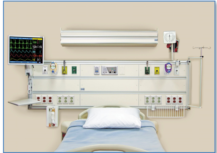
Figure 1. Majestic Series Recessed Double Tier Head-wall System

The Amico Majestic Series Recessed Double Tier Head-wall shall be manufactured by Amico Corporation, in accordance with job specific shop drawings and documents. The complete Headwall assembly shall be cULus listed. The following is a general specification, and components listed may not be present or required in final product.